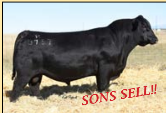
Tehama Tahoe B767

Don't need a bull right now? Come on out anyway, eat lunch and see the type of cattle we have available!