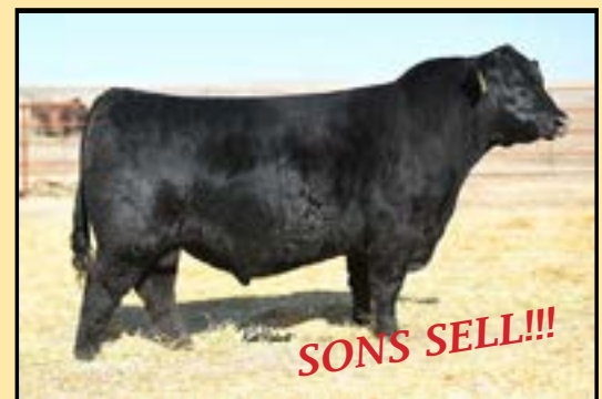
Basin Safe Deposit 9324

Call for directions, or search for Hopewell Farms Bull Development Center on Google Maps!